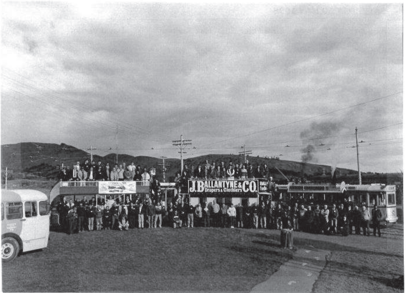
Conference delegates assembled in front of Kitson Steam Tram No.7 and double decker trailers Nos. 10 and 74 at Ferrymead Historic Park.