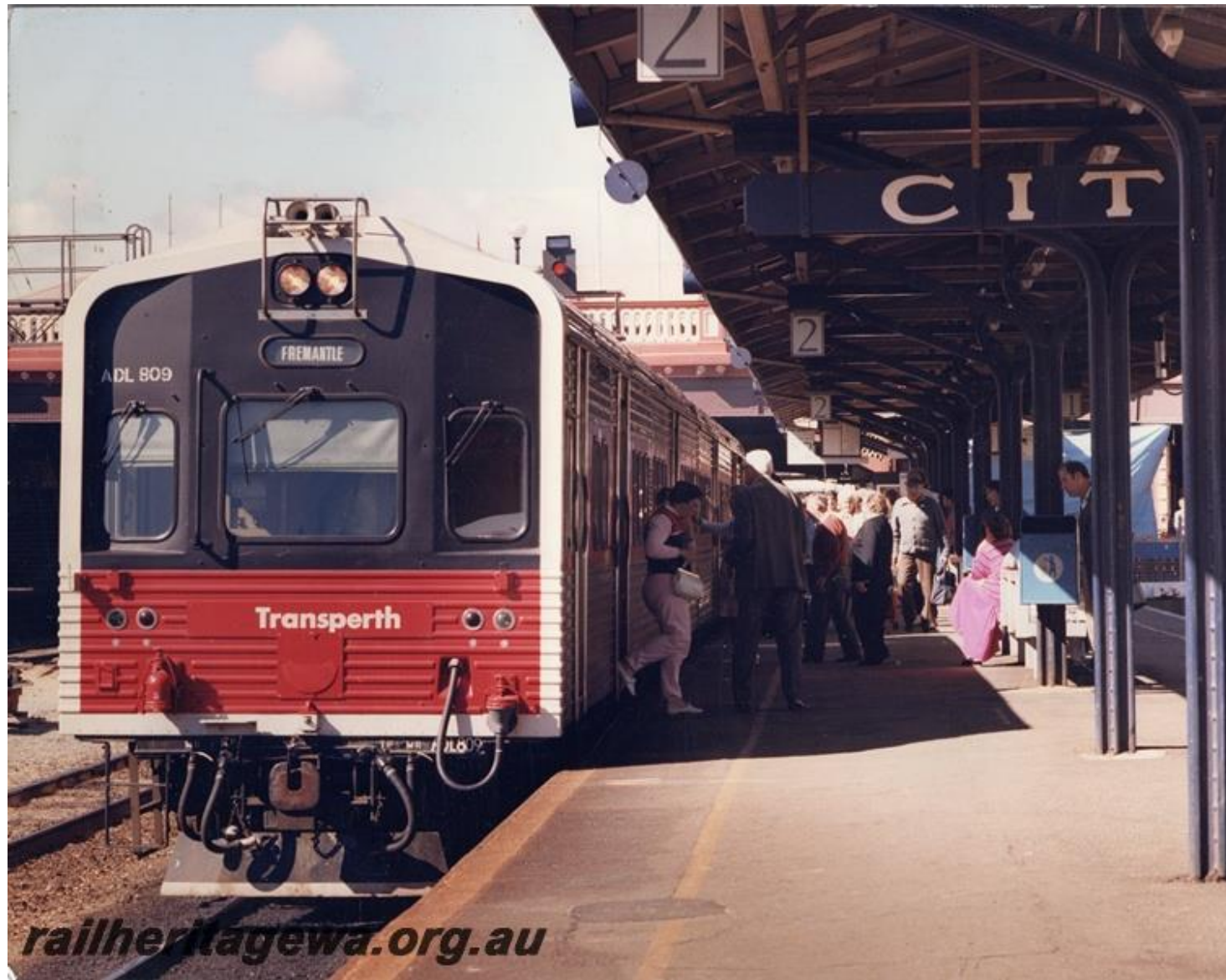
ADL 809 in Transperth livery – Perth Station