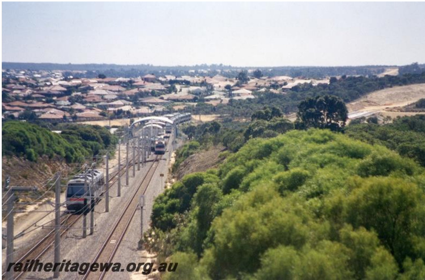
Currumbine – end of the line in 2000 – before the extension to Clarkson