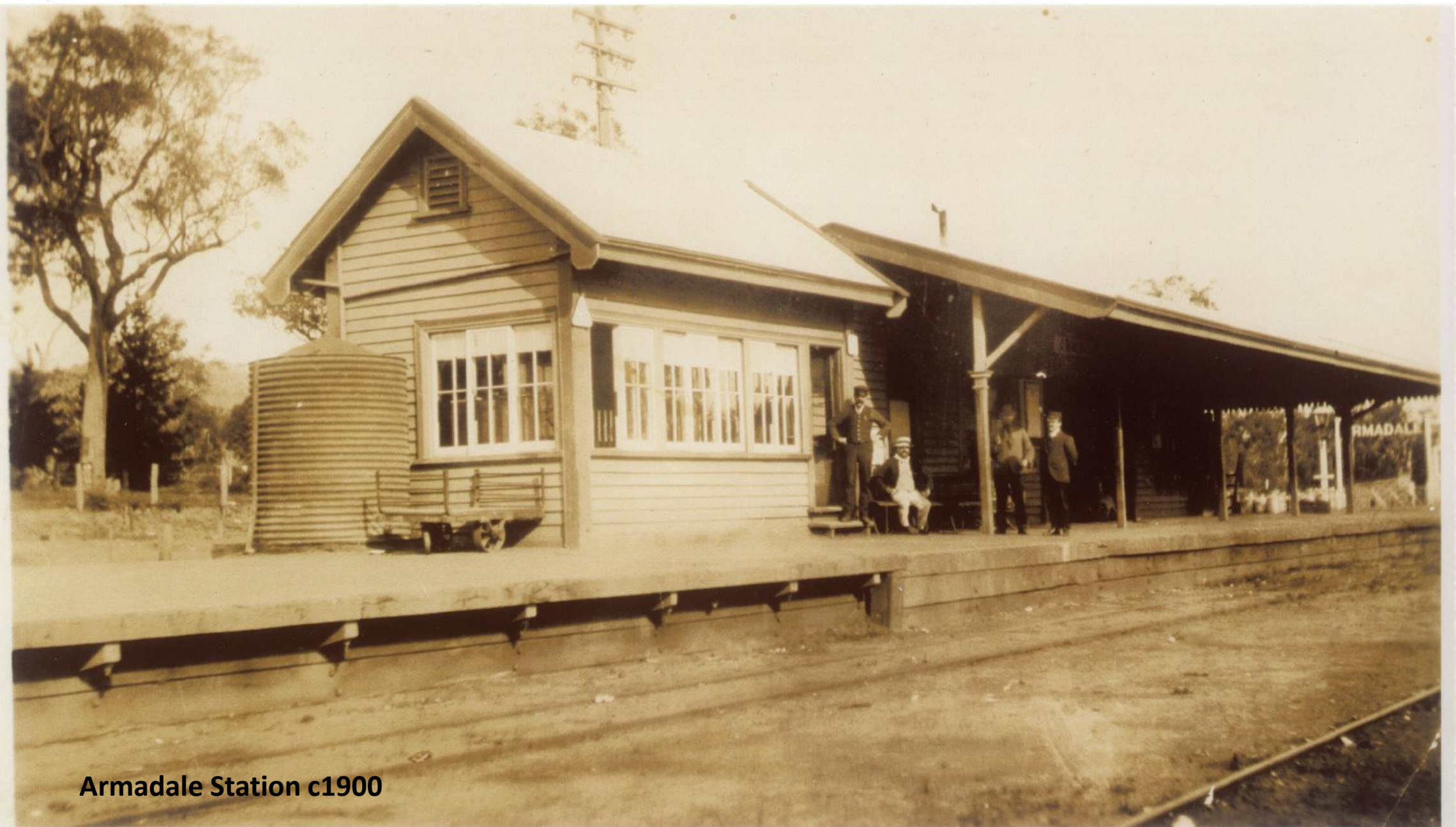
Armadale Station c1900