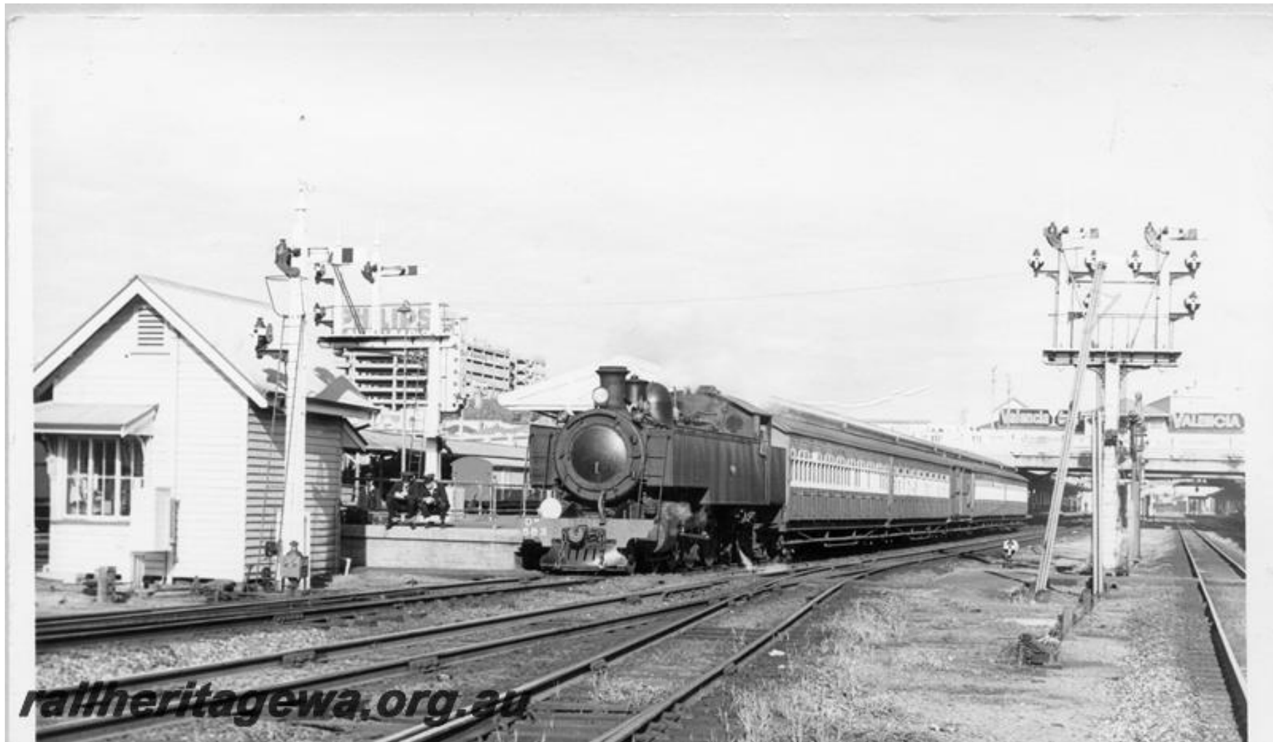
Steam loco and carriages on show train c 1960s