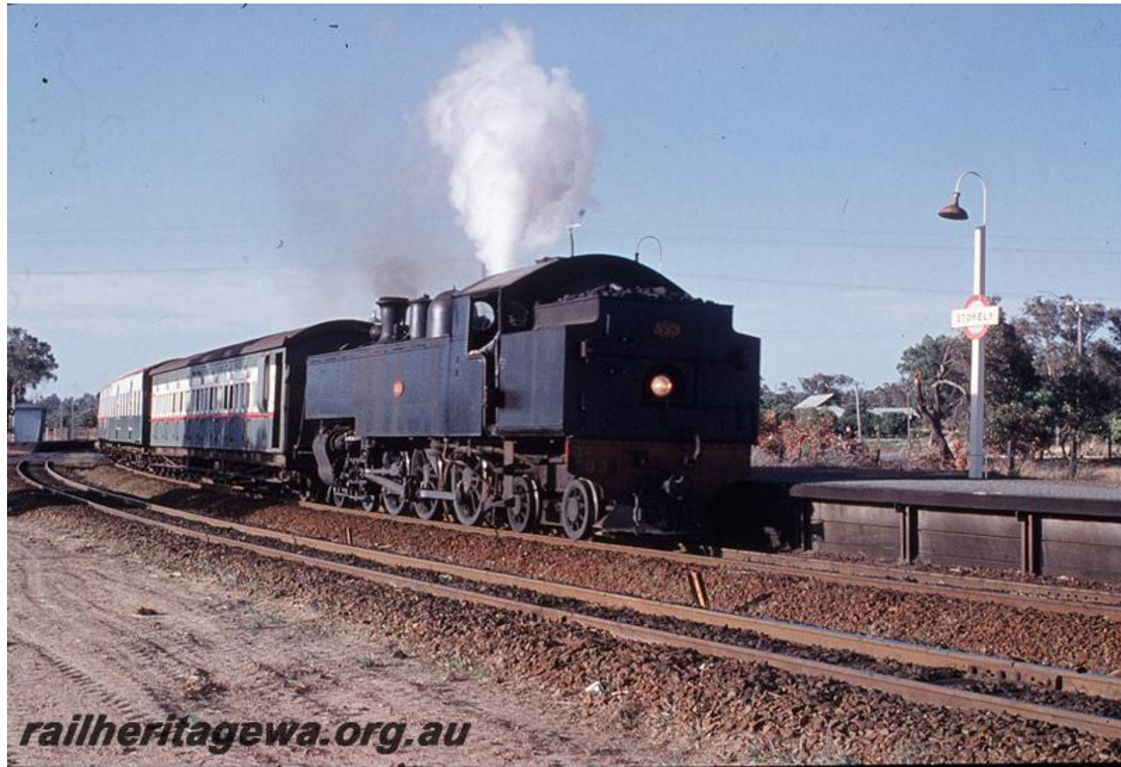
DD593 and coaches at Stokely – the station was years later bulldozed into oblivion overnight in the late 1980s