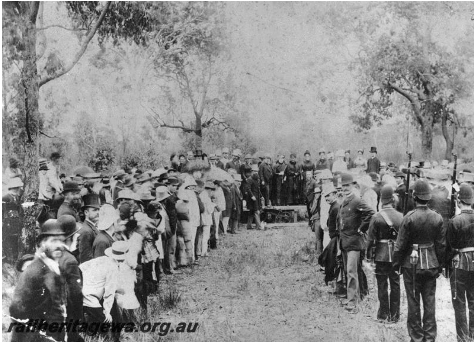
Turning the first sod Guildford c 1880