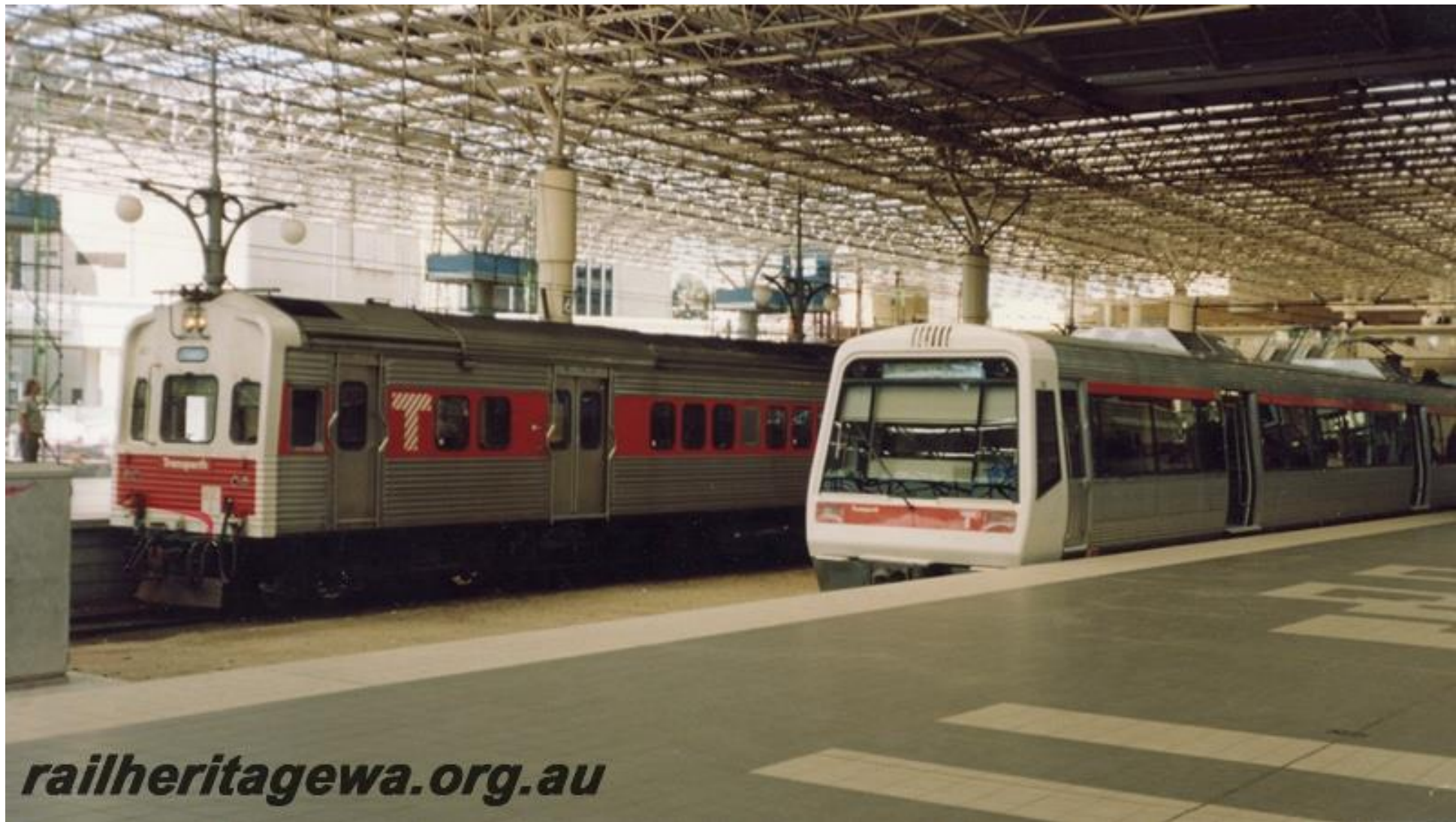
ADL & A Series railcars – Perth Station c 1990