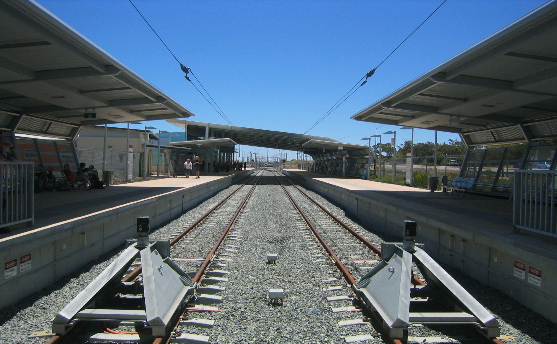
Mandurah station looking towards Perth