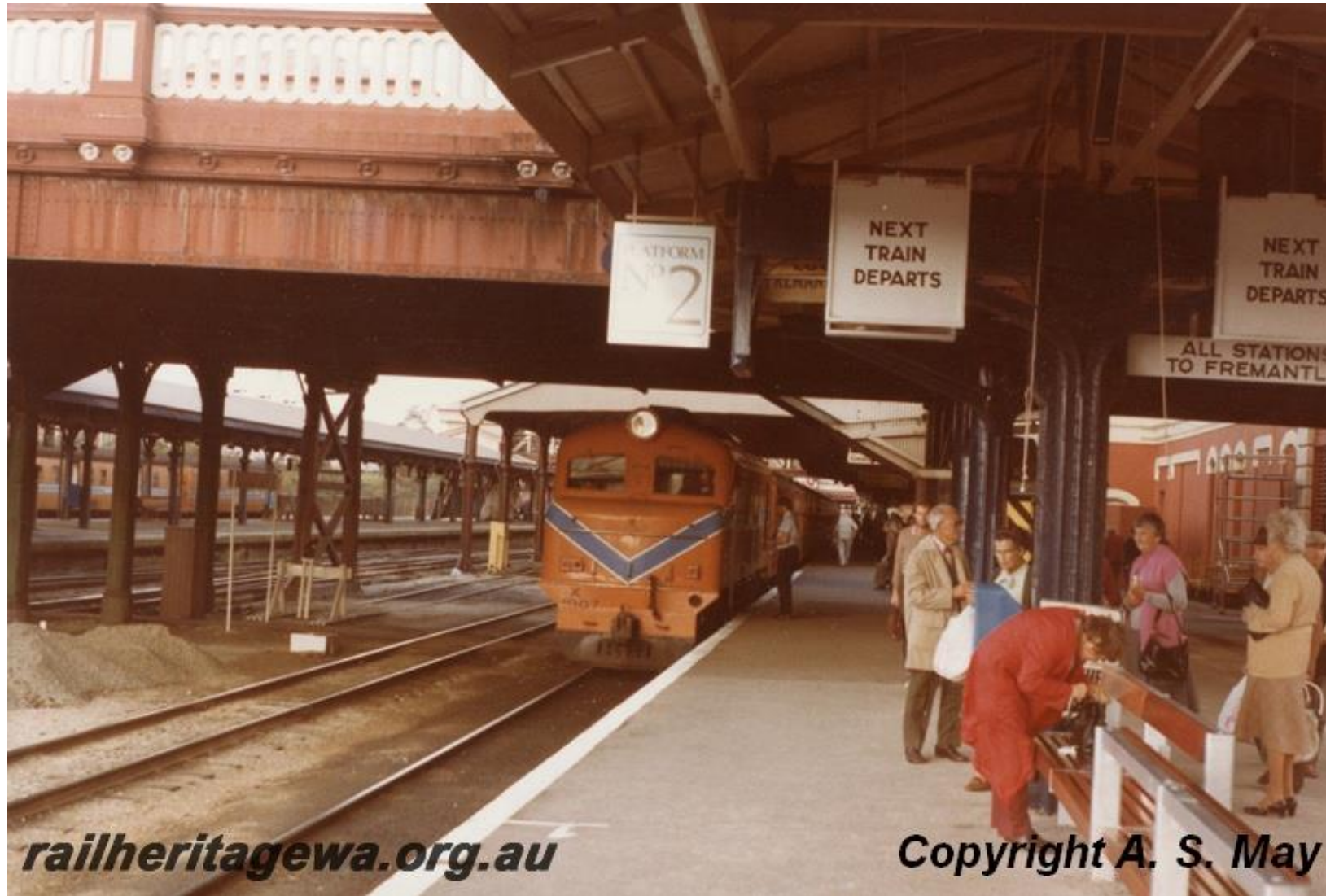
Reopening passenger services to Fremantle – diesel loco and wooden body carriages