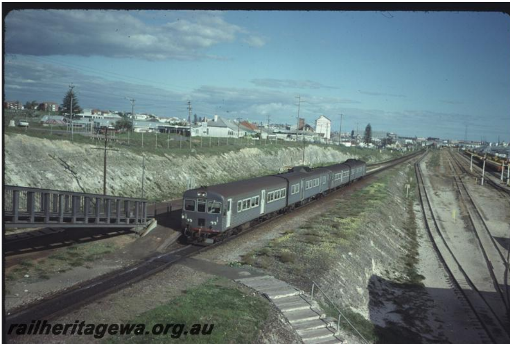
ADK railcars at Leighton stopping place