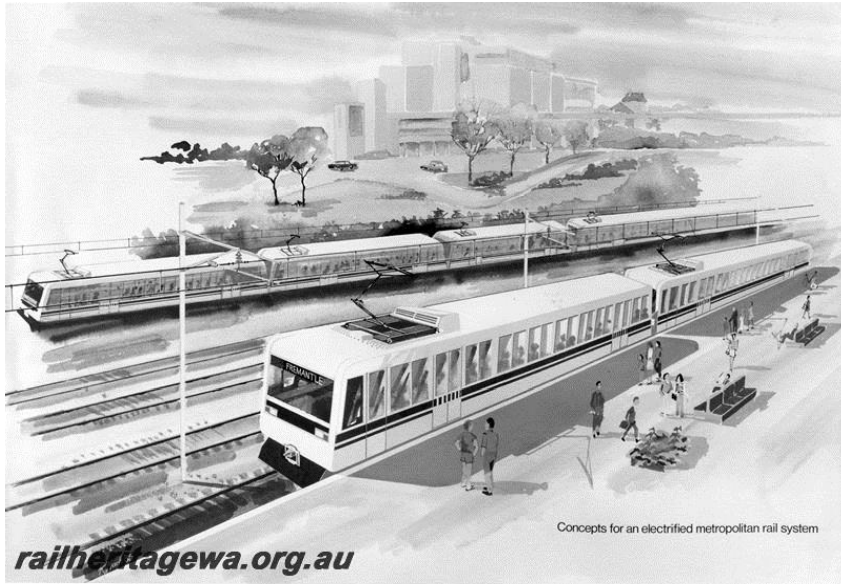
Artist's concept of an electric railcar set