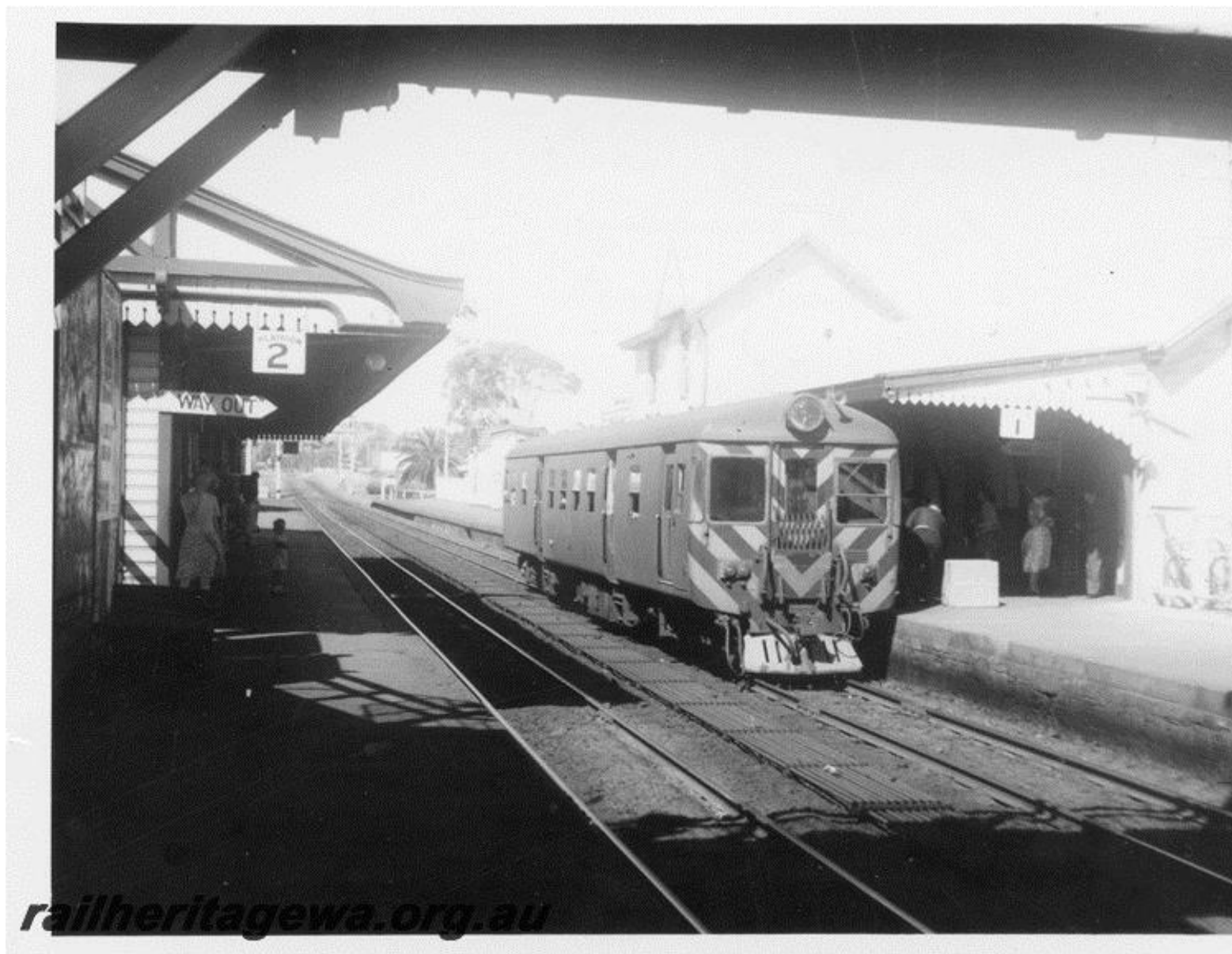
Claremont – Craven (UK built) new ADG railcar c1955