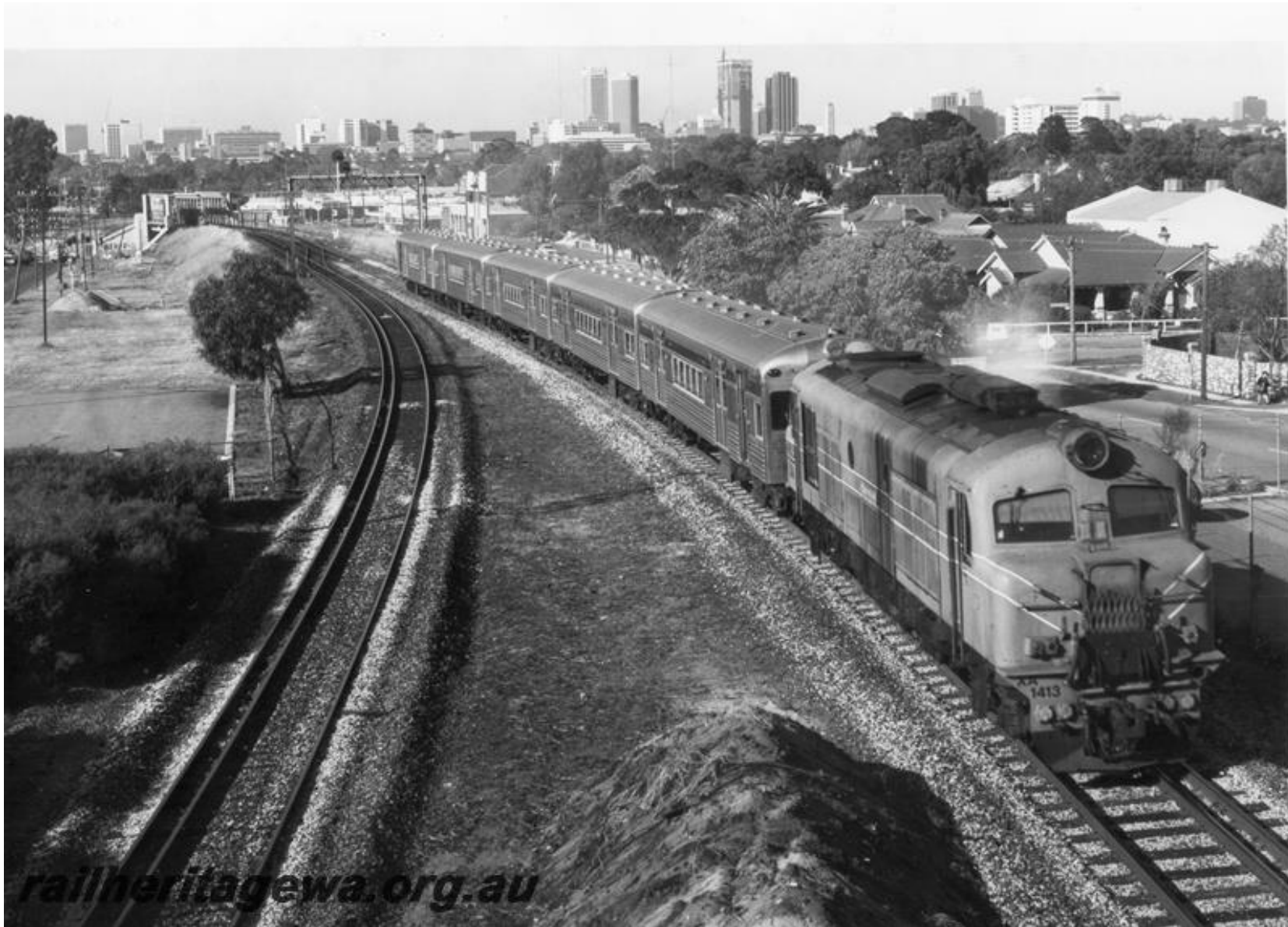
X class loco and QR steel coaches hired to augment the passenger stock – Mt Lawley