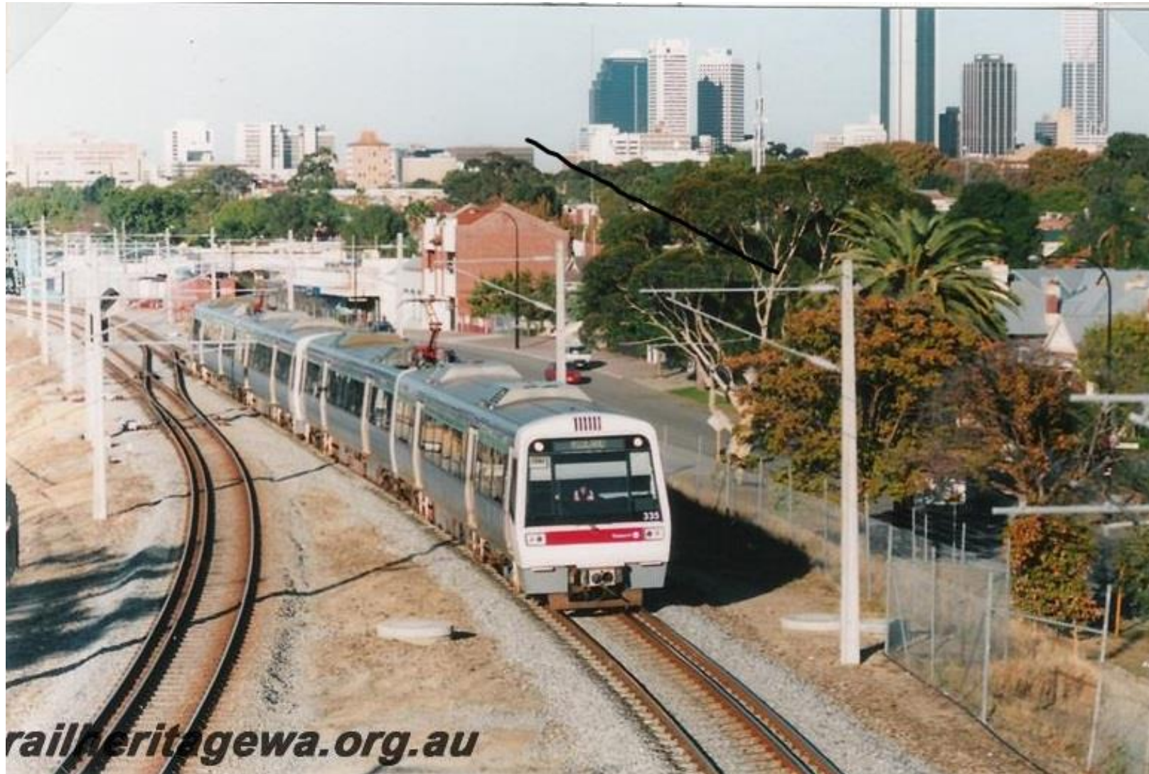
A series set 335 and another set at Mt Lawley