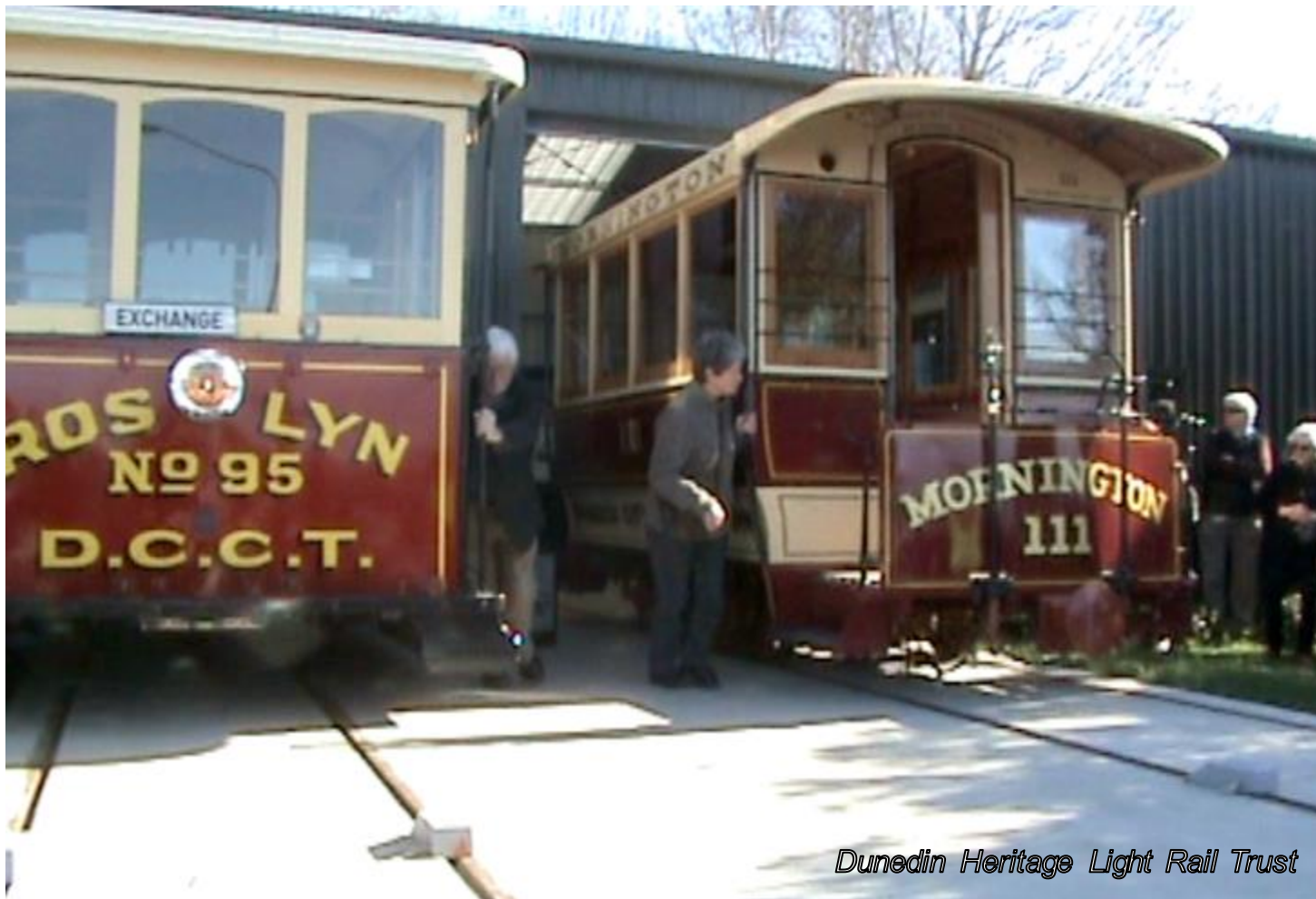
Dunedin Heritage Light Rail Trust