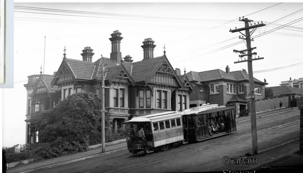
Mornington cable car, San Francisco style