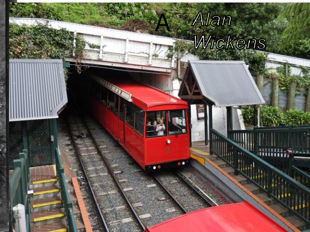
A Alan Wickens

Then, with power house and former horse-tram trailer; now, with Swiss-built cars Alan Wickens