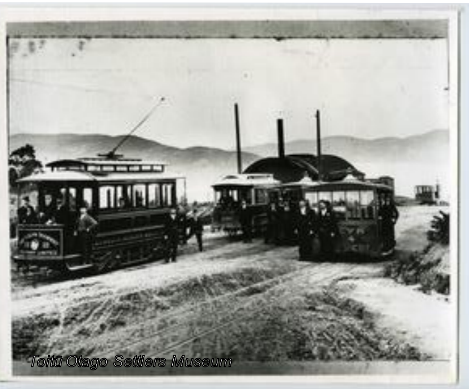
NZ's first electric tram with Roslyn cable car