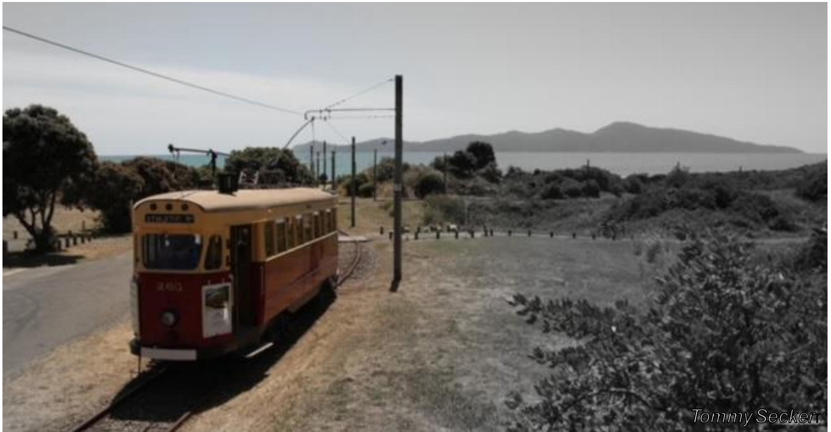
Fiducia tram and Kapiti Island