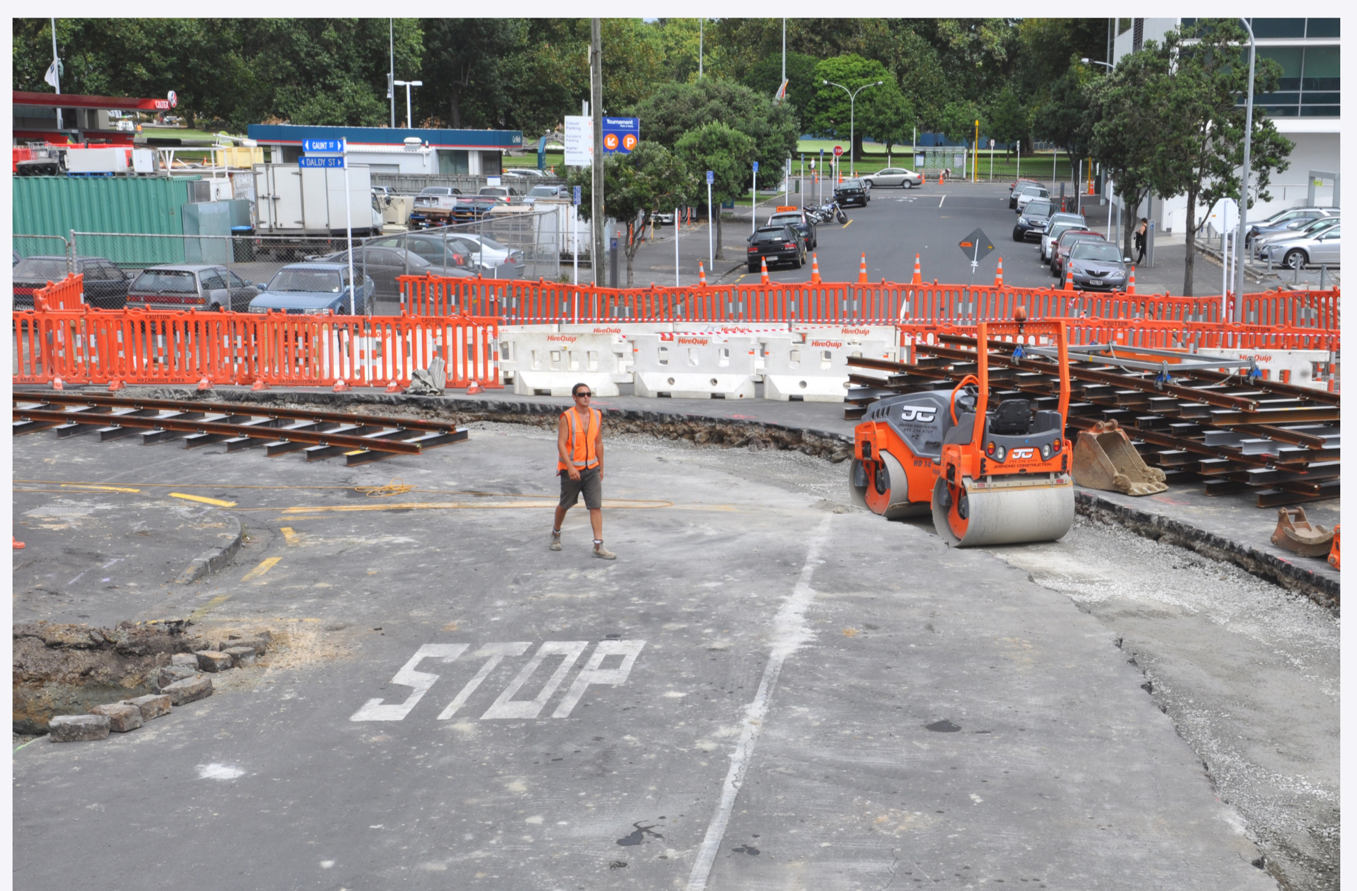
Forming of track bed prior to rail sets, pre rolled by Yarra Trams in Melbourne, being installed at the corner of Gaunt Street into Daldy Street.